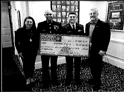
St. John's Prep (MA)